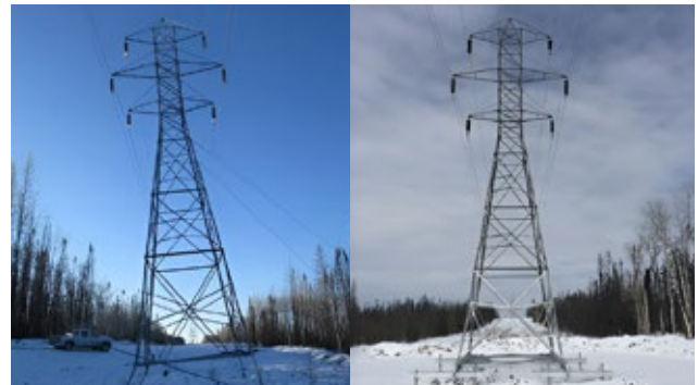
Before and after tower leveling