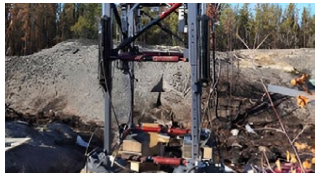
Guyed tower repair