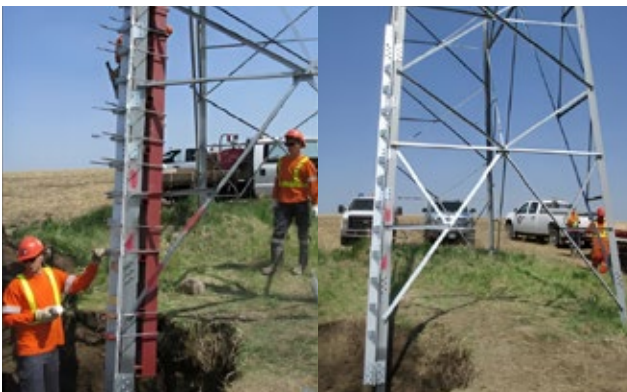
Leg repair during and after