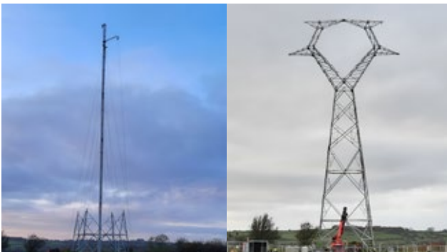
Construction of custom tower

Enhance capacity with Ampjack's reliable voltage re-rating solutions.